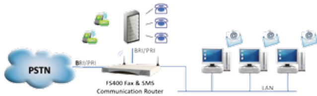
Fax & SMS with PBX Voice Pass-through Setup

The FS400 allows two implementation architectures: